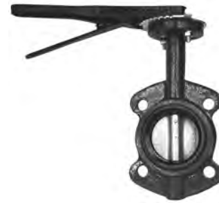
Figure Number Breakdown (Example 937DNSL)